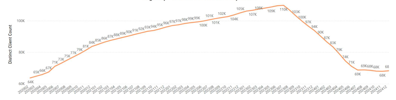
Eligibility - Number of Consumers by Month

Remittance Refresh Date: 1/29/2025 Eligibility Refresh Date: 2/9/2025