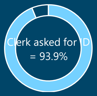
Compliance Rates by County

LRE sample selected by MDHHS = 51, Inspected = 49 (2 do not sell tobacco)